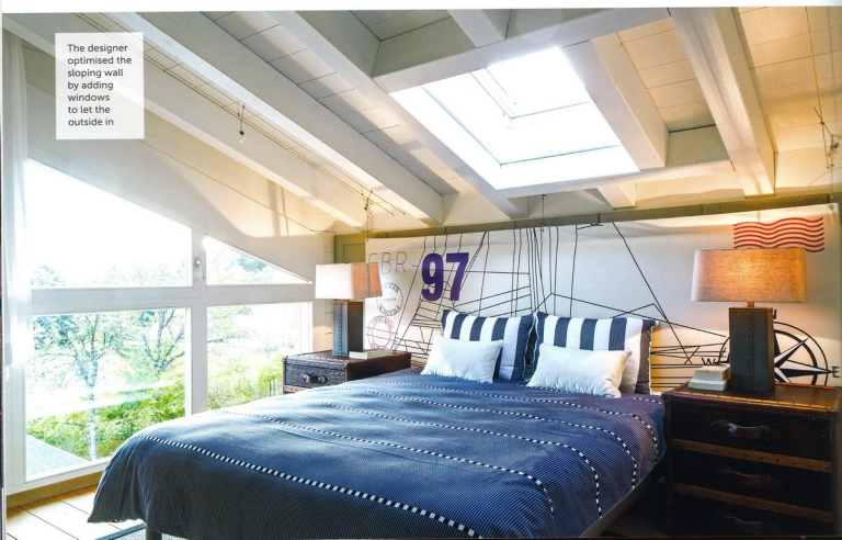
The designer optimised the sloping wall by adding windows to let the outside in