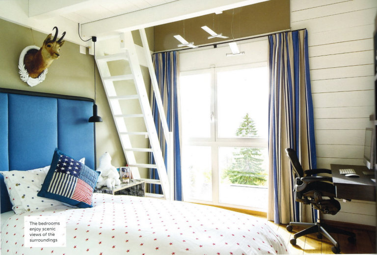
The bedrooms enjoy scenic views of the surroundings