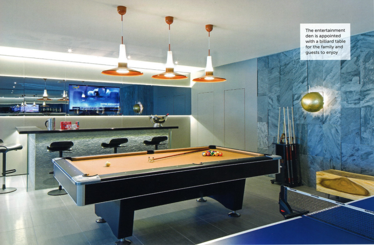
The entertainment den is appointed with a billiard table for the family and guests to enjoy