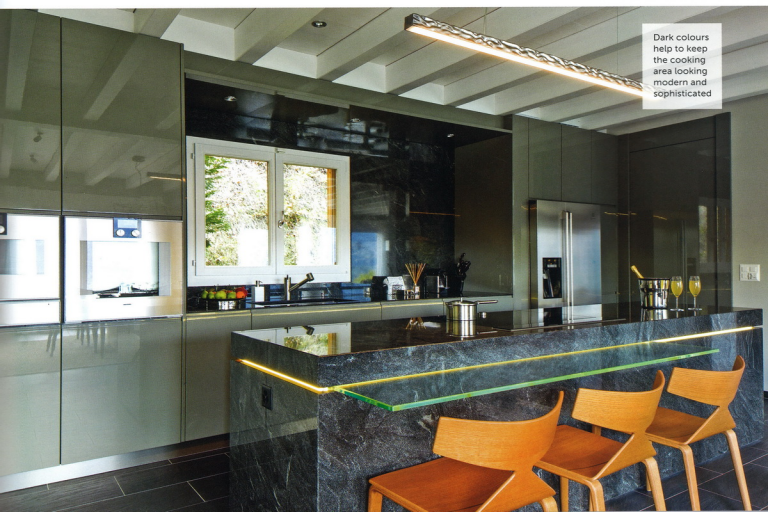
Dark colours help to keep the cooking area looking modern and sophisticated